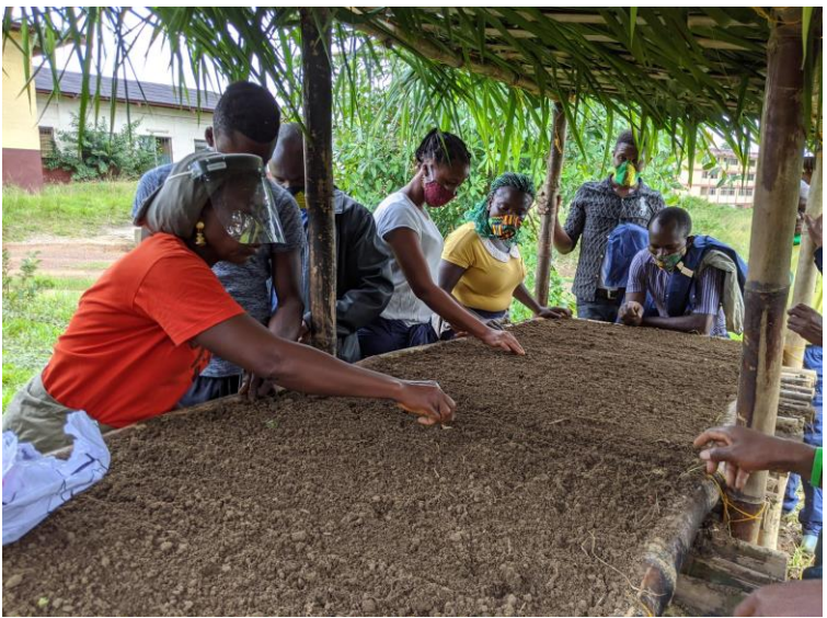
For Q4, show the following picture of a nursery.