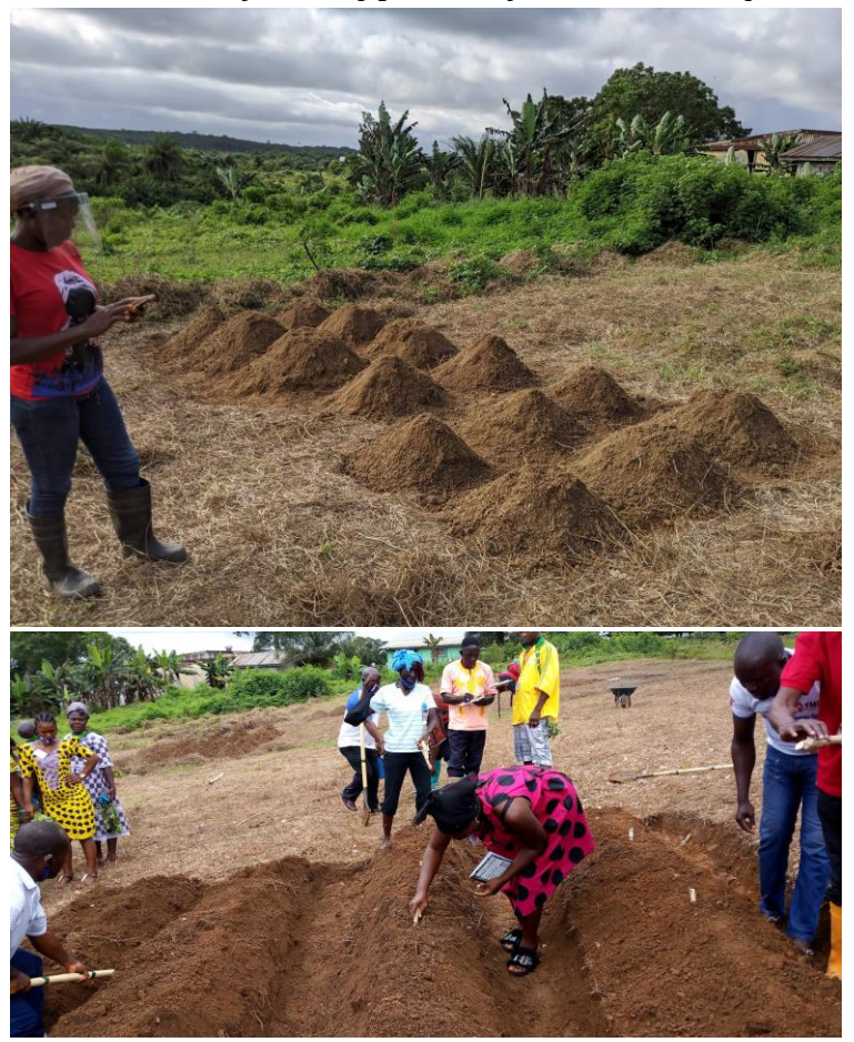
(Read to subjects) Explanation:

These are raised beds. This means the farmer does not farm on flat land. There are two types. One is like a hill, and is called mounds. They look like this (enumerator, show the picture). One is called ridges, and looks like this (enumerator, show the picture).