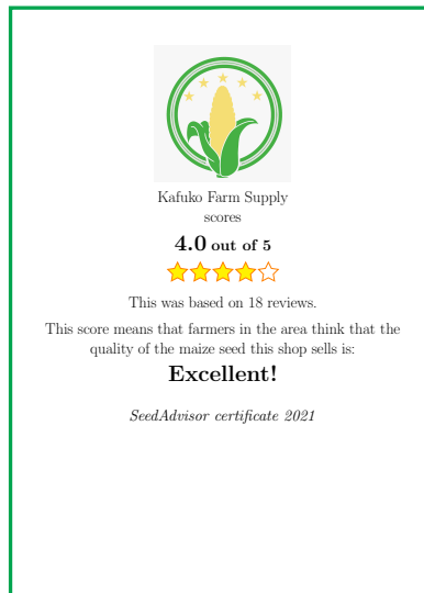
Figure A.1: SeedAdvisor certificate