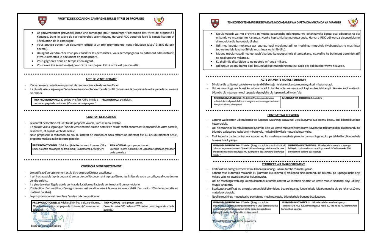
Figure 2: Information flyer (medium price tier). French (left) and Tshiluba (right)

construct an intensive version of the treatment, with three levels corresponding to each of the aforementioned titles.