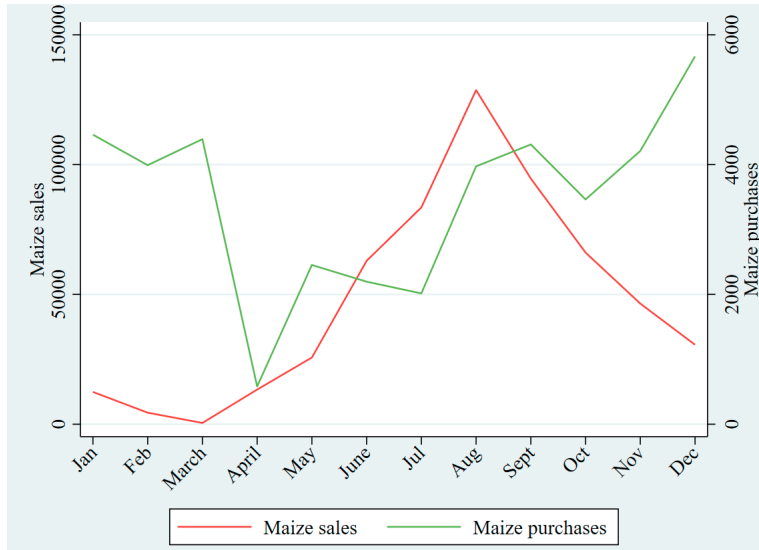
Figure 2: Quantities of maize bought and sold

means that we will focus mostly on simply comparing treatment and control post treatment (as opposed to difference-in-difference). Specification will also depend on the time horizon and relevance of pooled treatment effect. For instance, when flow variables like stocks held by farmers used as outcome variables, we expect that the difference between treatment and control will be largest in the early in the season. Therefore, when this outcome variable is used, we estimate a (separate treatment effect) for September 2022 and December 2022. This will be modeled with a simple OLS regression that also has an interaction dummy for treatment and the first two survey rounds (September 2022 and December 2022). For sales made by farmers, we expect that the treatment effect reverses over time, as early in the season, control farmers are likely to make sales, while later in the season (December 2022 and March 2023), treatment farmers are likely to make sales. This will be modeled with a simple OLS regression that also has an interaction dummy for treatment and the last two survey rounds (December 2022 and March 2023).