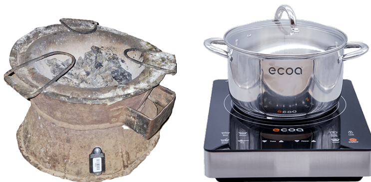
Figure 1: Charcoal stove and induction stove

We conduct an experiment to study the adoption of an induction stove manufactured by ECOA (formerly Burn Manufacturing), shown on the right in Figure 1 . Purchase of an induction stove also includes three induction pots. The induction stove has a power rating of 200W–2000W depending on the desired functionality (from low simmer to high boil).